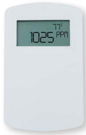
North American style