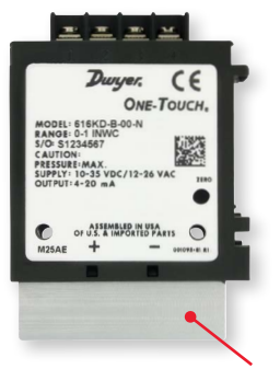
Optional NPT connection block