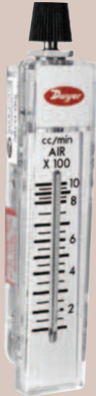
Model RMA-TMV 2" scale, 4-13/16" high