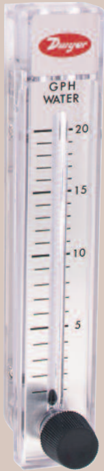
Model RMB-SSV 5" scale, 8-3/4" high