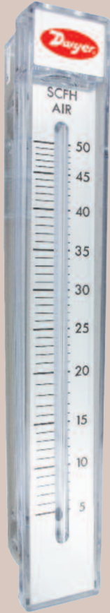
Model RMC 10" scale, 15-3/8" high