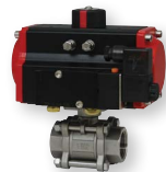
Model SN mounted to an actuator