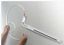
1227 mounted in incline position