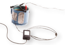
USB HART modem

The Model DEVCOM2000 HART® Communication Protocol Software turns your PC into a full-featured HART® communicator. Now it is possible to configure transmitters and control valves at the desktop or in the field. DevCom2000 uses device descriptions (DDs) to retrieve data that is stored in the memory of smart field devices. This software is a simple, reliable and secure method to add new measurement values to control systems without the need of additional wires. This software eliminates the need to purchase and maintain a separate handheld HART® communicator.