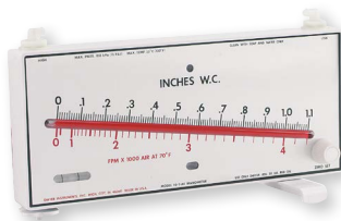
40-AV – Shown with standard swing-out stand and leveling screw installed.