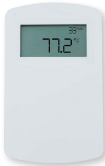
North American style